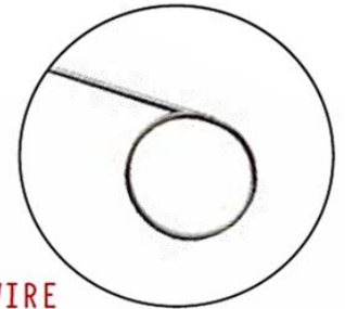
O-TYPE HOOK WIRE